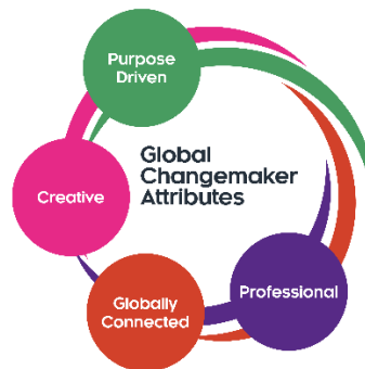
The Heriot-Watt Graduate Attributes

Quite simply, without integrity one cannot call themselves a professional graduate.