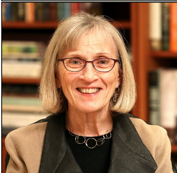
Professor Claudia Goldin, Harvard University

"advanced our understanding of women's labor market outcomes."