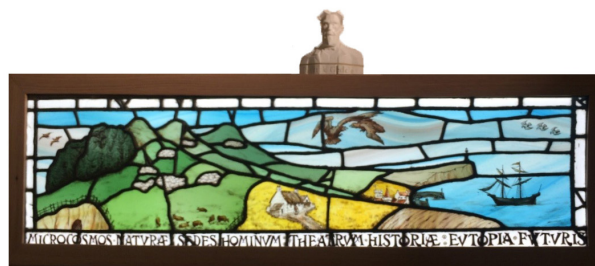
Geddes' Valley Section and 3D print of Patrick Geddes.