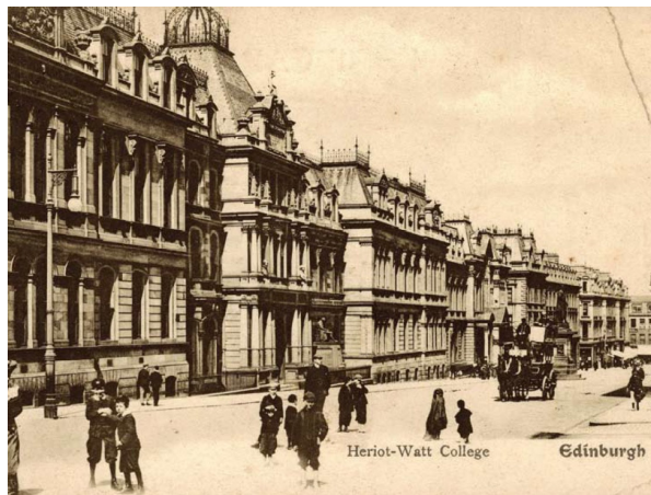
Heriot-Watt College, Chambers Street in the early 1900s.

Heriot-Watt University Edinburgh Campus Edinburgh EH14 4AS T: +44 (0) 131 449 5111 www.hw.ac.uk